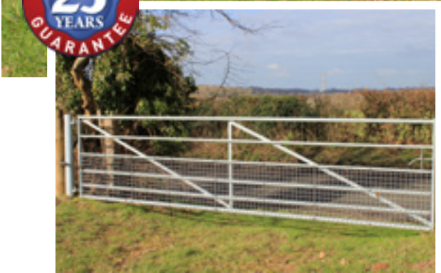
The top and bottom rails are 41.5mm tube, with middle rails which are 32mm tube.