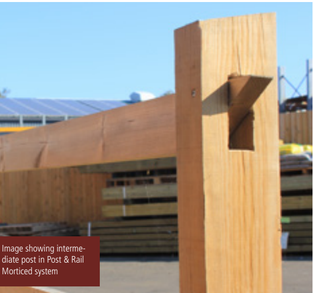
Image showing intermediate post in Post & Rail Morticed system

Allow one post and one prick post for every 2.85m of fence, plus one post for the end of the run. Allow three rails per 2.85m run of 3-rail fence, and four rails per 2.85m of 4-rail fence.