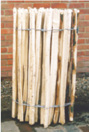
Style A - (2 rows of wire)

Please note: this Chestnut fencing is not Jakcure® treated timber as Chestnut is a hardwood and therefore cannot be guaranteed for 25 years.