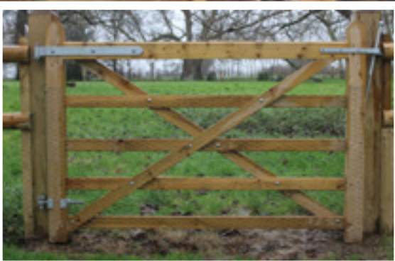
Gate shown with additional chicken wire

To see our latest prices, view Cleft Chestnut fencing on our website by scanning the QR code.