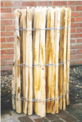
Style B - (3 rows of wire)

Approximate spacing: 81 pales in a 9.10m roll. Pales are 75mm spaced. We recommend installation with our machine round Jakcure® posts for long life.