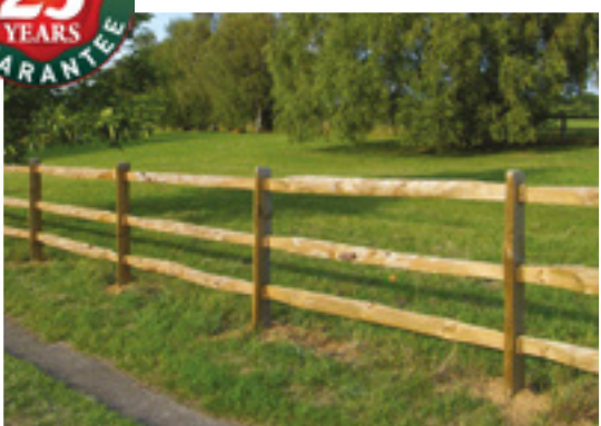
Comprising of half round vertical posts, with either three or four mortices, for the irregular sawn horizontal rails to insert into.