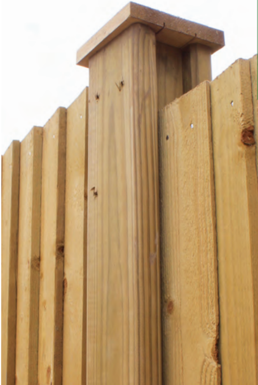
Featherboard Panels slotting easily into Jakpost