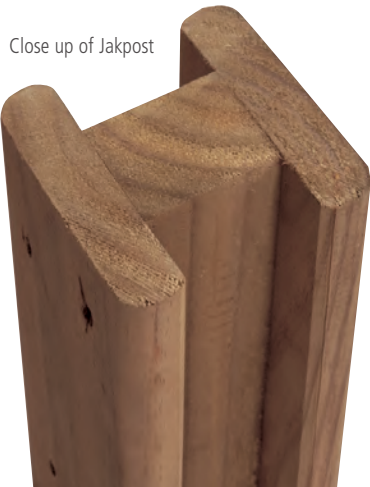
Close up of Jakpost