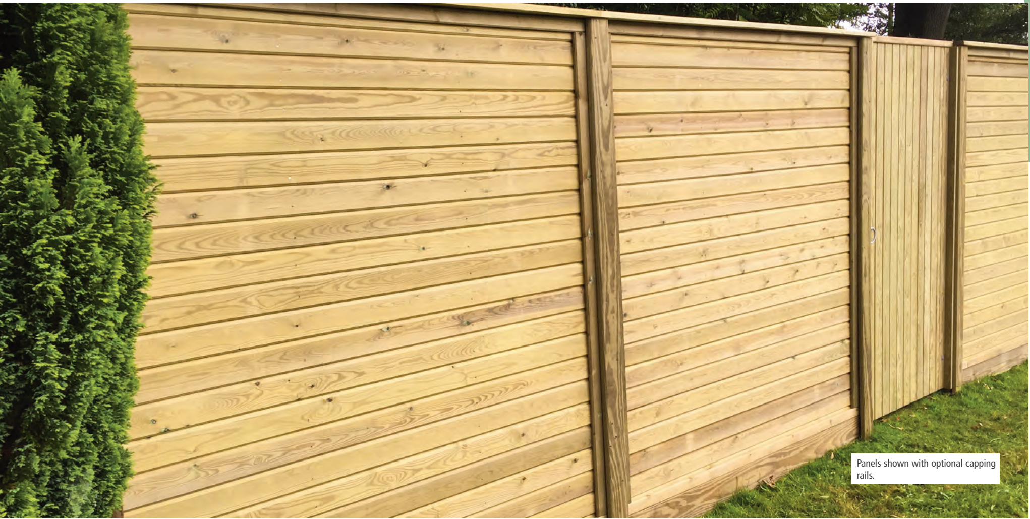
Panels shown with optional capping rails.