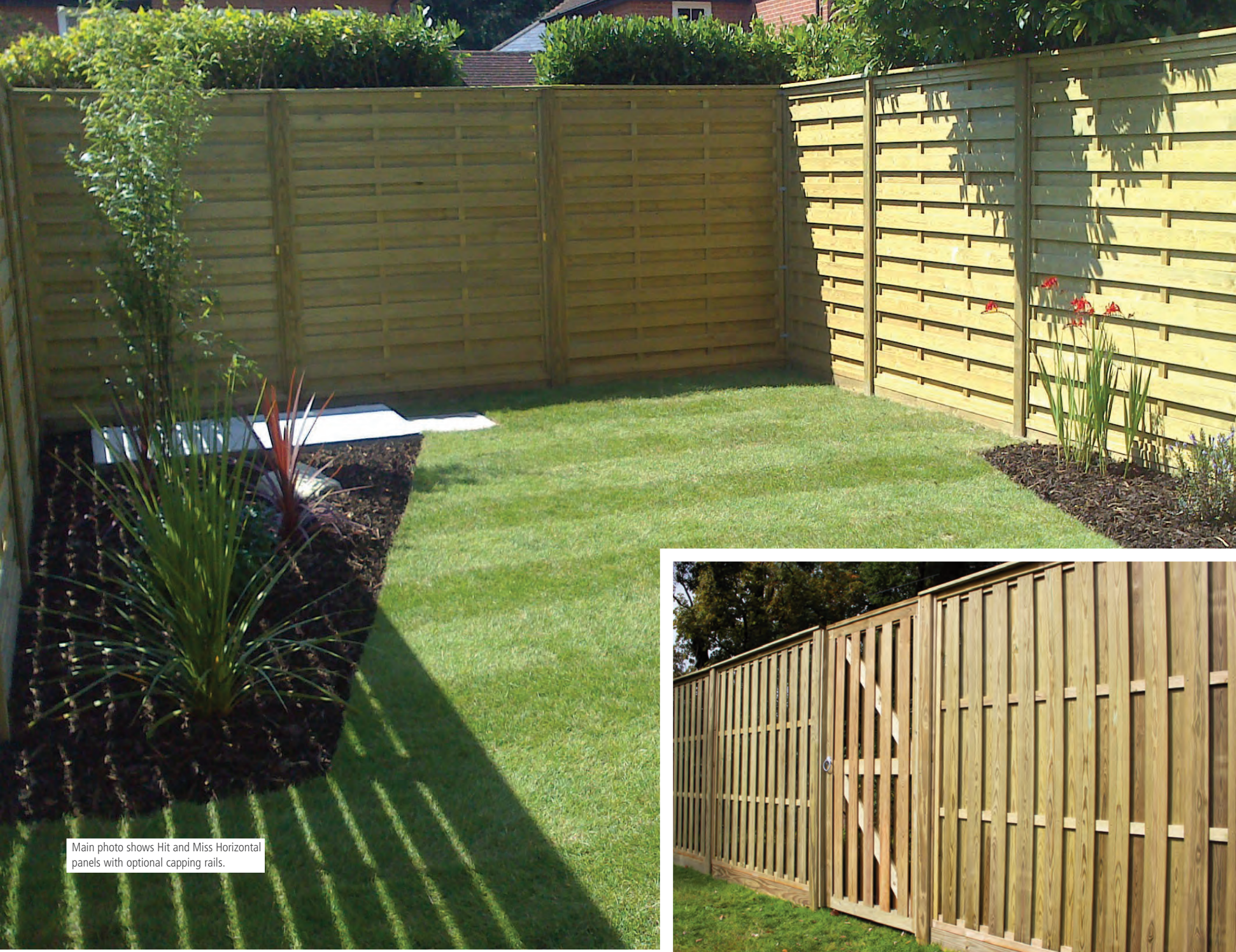
Main photo shows Hit and Miss Horizontal panels with optional capping rails.