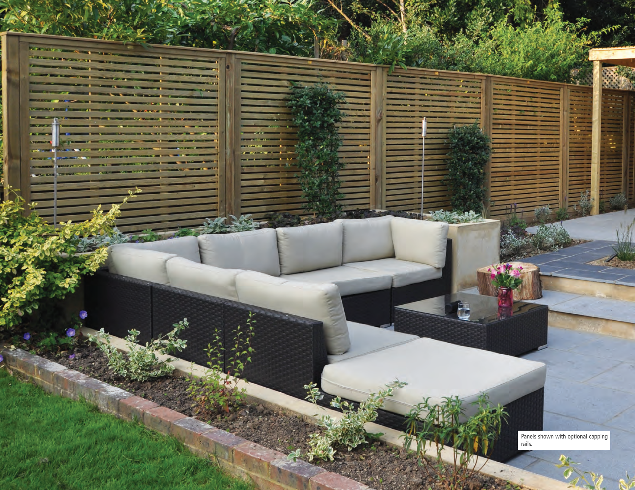
Panels shown with optional capping rails.