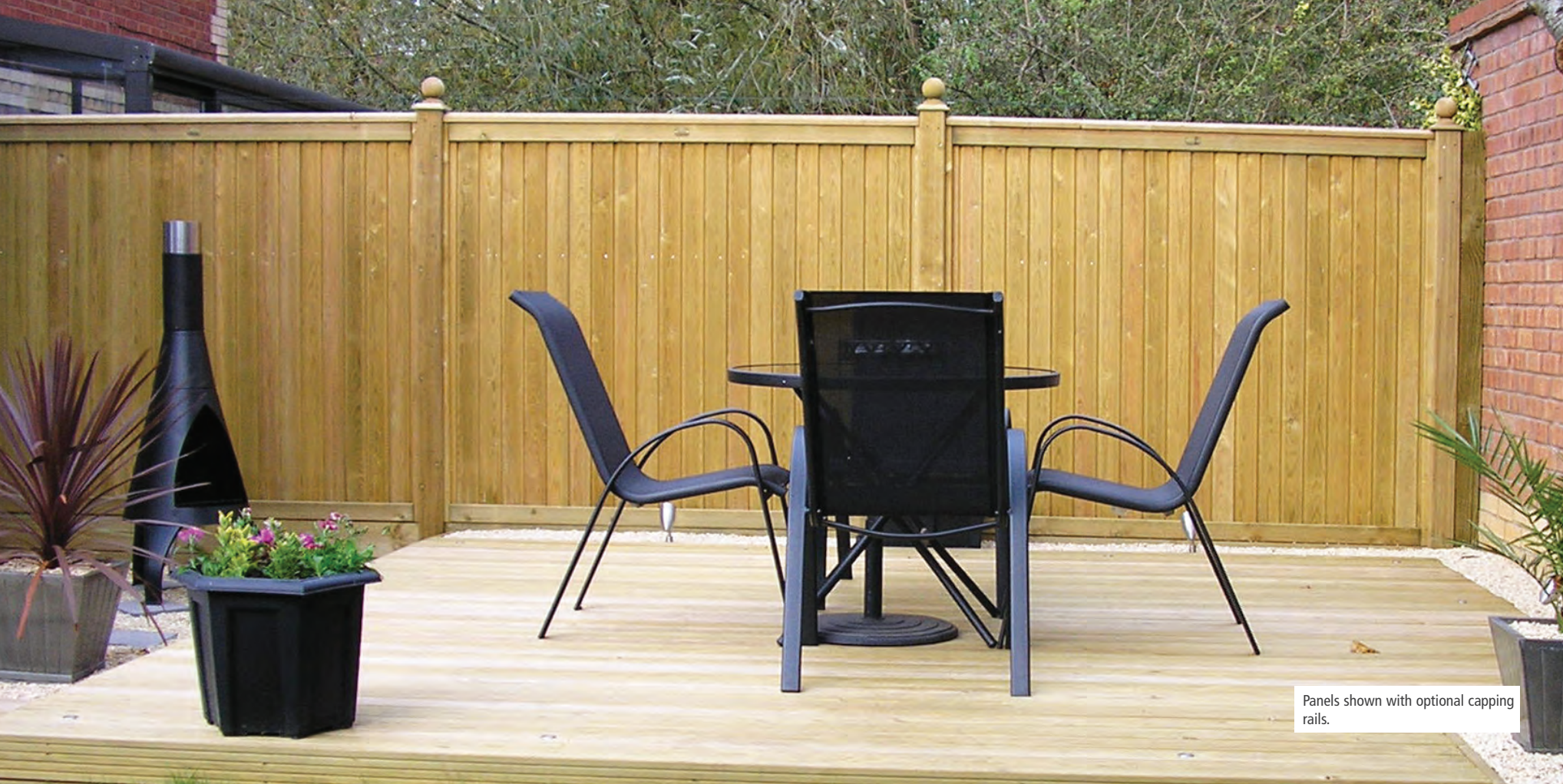
Panels shown with optional capping rails.