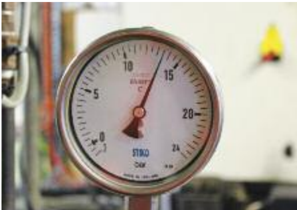
Pressure gauge showing 12.4 bar reading

The chamber is then pressurised. To put this into context mains water pressure is typically 3-4 bar, in the chamber we increase the pressure to at least 12.4 bar, approximately four times more than mains water pressure.