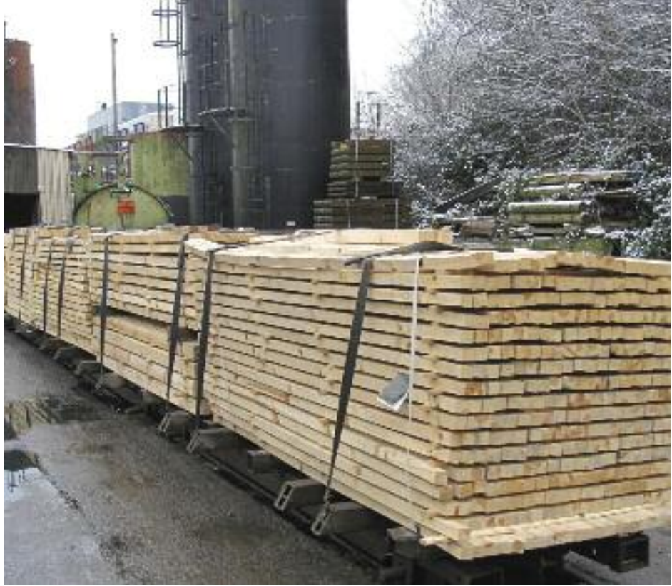
Kiln dried timber stacked prior to going into the treatment chamber

By creating a vacuum, and then flooding the chamber with the preservative chemical, the kiln dried timber takes up the chemical more readily.