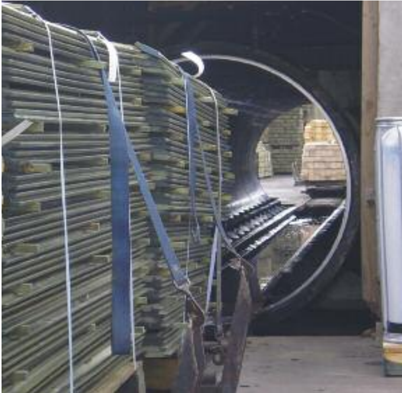
The treatment chamber with timber that has been through the pressure treatment process

The higher the amount of chemical required to realise optimum protection, the more difficult it is to achieve permeation - and the environmental cost of such high volumes of chemical should also be considered.