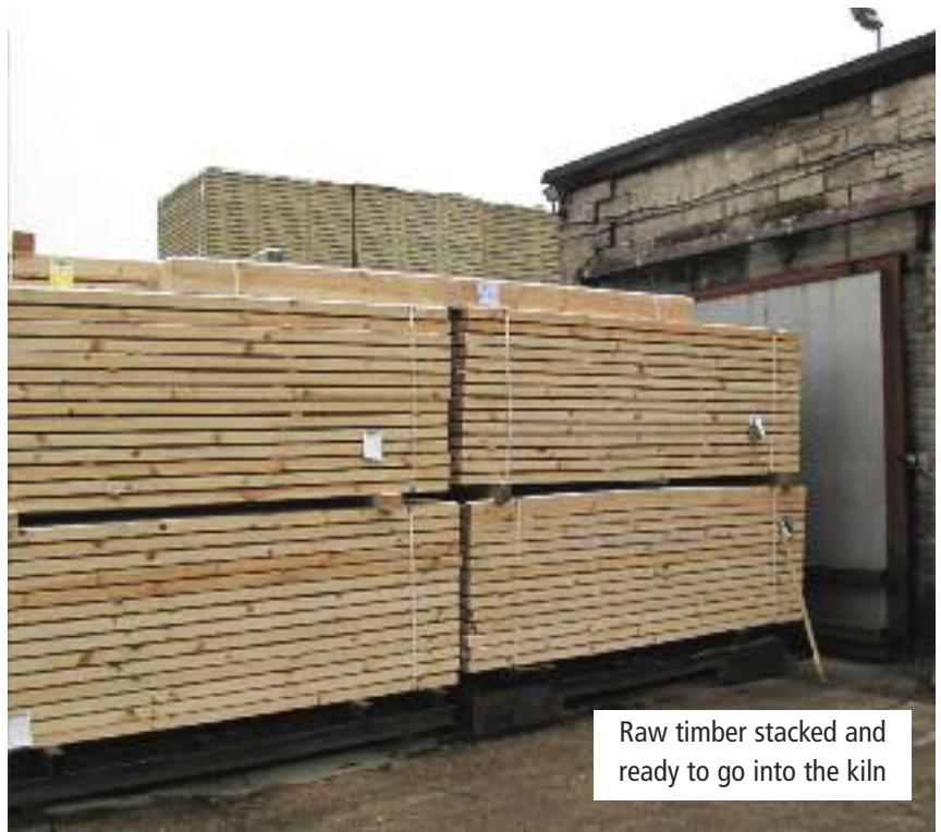
Raw timber stacked and ready to go into the kiln

Eight raw timber posts are selected as samples. Timber is a natural material and takes up water as it grows. So when it arrives from the sawmill it will be very wet, sometimes with a moisture content in excess of 100%