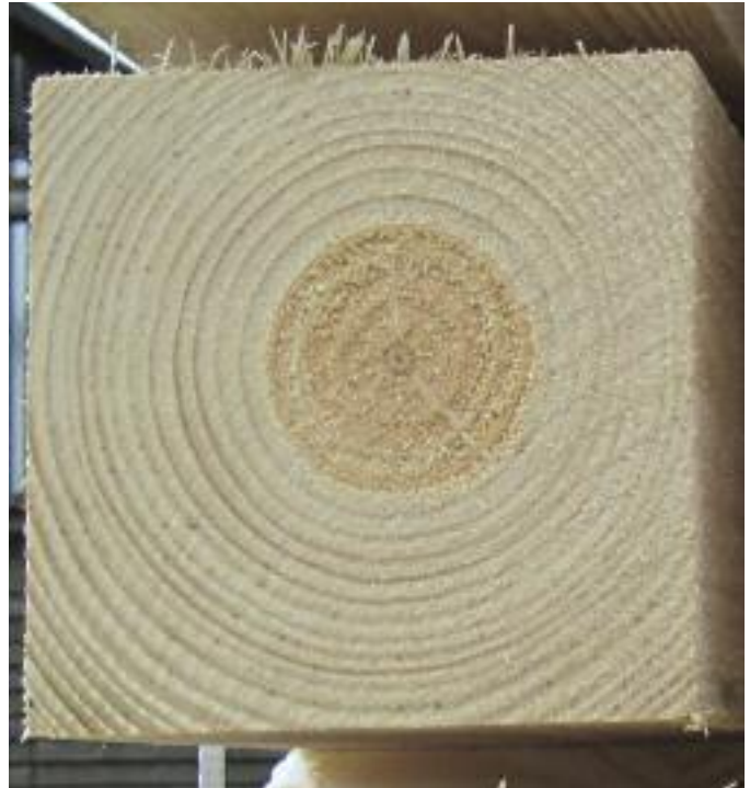
The cross section of an untreated timber post shown above shows the lighter sapwood surrounding the darker heartwood.

Heartwood is wood that as a result of a naturally occurring chemical transformation process, has become more resistant to decay. Sapwood is the younger, outermost wood on the tree which is essential for carrying water and sugars from the roots to the leaves. When a rigorous timber treatment process is carried out, the procedure involves the delivery of preservative through the sapwood of the timber, (which as the 'living' outermost section of the wood, is most likely to become adversely affected by the challenges of the outdoor environment) right through and into the heartwood, which although technically dead, is still susceptible to rot and damage caused by wood-boring pests. Although more durable than the sapwood, the heartwood in some tree species may deliver a reduced resilience, (particularly those that feature sapwood conducive to absorbing the preservative).