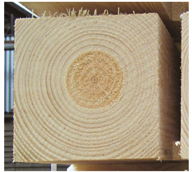
The cross section of an untreated timber post shown above shows the lighter sapwood surrounding the darker heartwood.

The reason for developing this reference source is simply to put the record straight once and for all, and to share Jacksons' knowledge in relation to the factors that contribute to a lasting, quality timber fencing / gate installation. Our intention is also to simplify what is a fairly complex subject and to provide easy to follow guidance that is not over complicated by taxing technical references.