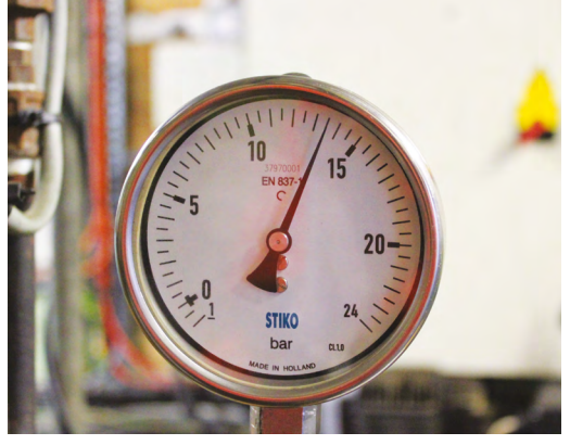
Pressure gauge showing 12.4 bar reading

The chamber is then pressurised. To put this into context mains water pressure is typically 3-4 bar, in the chamber we increase the pressure to at least 12.4 bar, approximately four times more than mains water pressure.