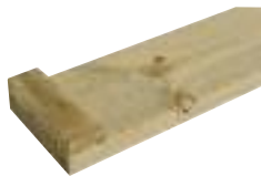
Gravel Boards for use with slotted Jakpost.

Please note that gravel boards need to be used to avoid panels being in contact with the ground as part the 25 year Jakcure guarantee conditions - more detail can be found on our Jakcure T&Cs page on our website or at the back of this book.