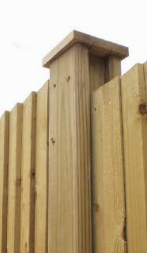
Featherboard Panels slotting easily into Jakpost