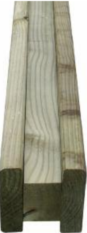
Heavy duty slotted post- Intermediate

Square Section Panel Posts Planed finish (not slotted). These are standard square section posts without the unique slot that our superior slotted Jakposts have. It is advisable to fix panels to posts with Jakclips when using standard posts. See page 146.