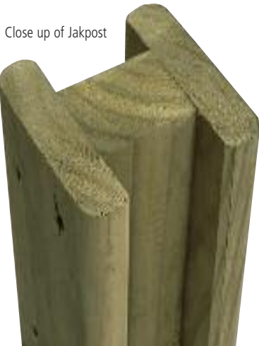
Close up of Jakpost