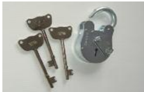
RADAR padlock and three keys

RADAR Padlock Rights of way gates can be secured in the closed position with a padlockable drop bolt, this can be used with a RADAR padlock.