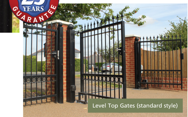
Level Top Gates (standard style)

Ornamental fencing and gates are available in two designs, Arched Top Ornamental gate and Level Top Ornamental gate and in three styles: Style A, Style B and Standard.