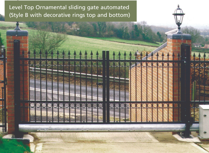
Level Top Ornamental sliding gate automated (Style B with decorative rings top and bottom)

Ornamental fencing and gates are available in two designs, Arched Top Ornamental gate and Level Top Ornamental gate and in three styles: Style A, Style B and Standard.