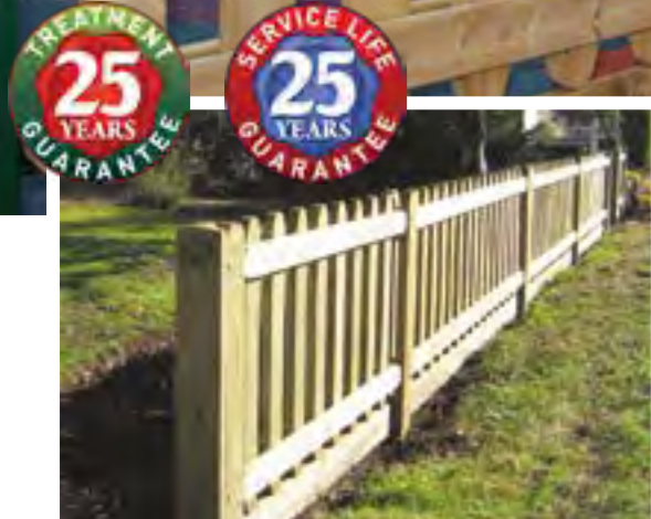
Playtime® Timber Panel

Timber Playtime® fencing was originally designed for play areas in parks, recreation areas and nursery/primary schools. However, it has also proven to be popular in rural settings as a demarcation or front garden fence. Its appearance is like a very robust version of a palisade or picket fence.