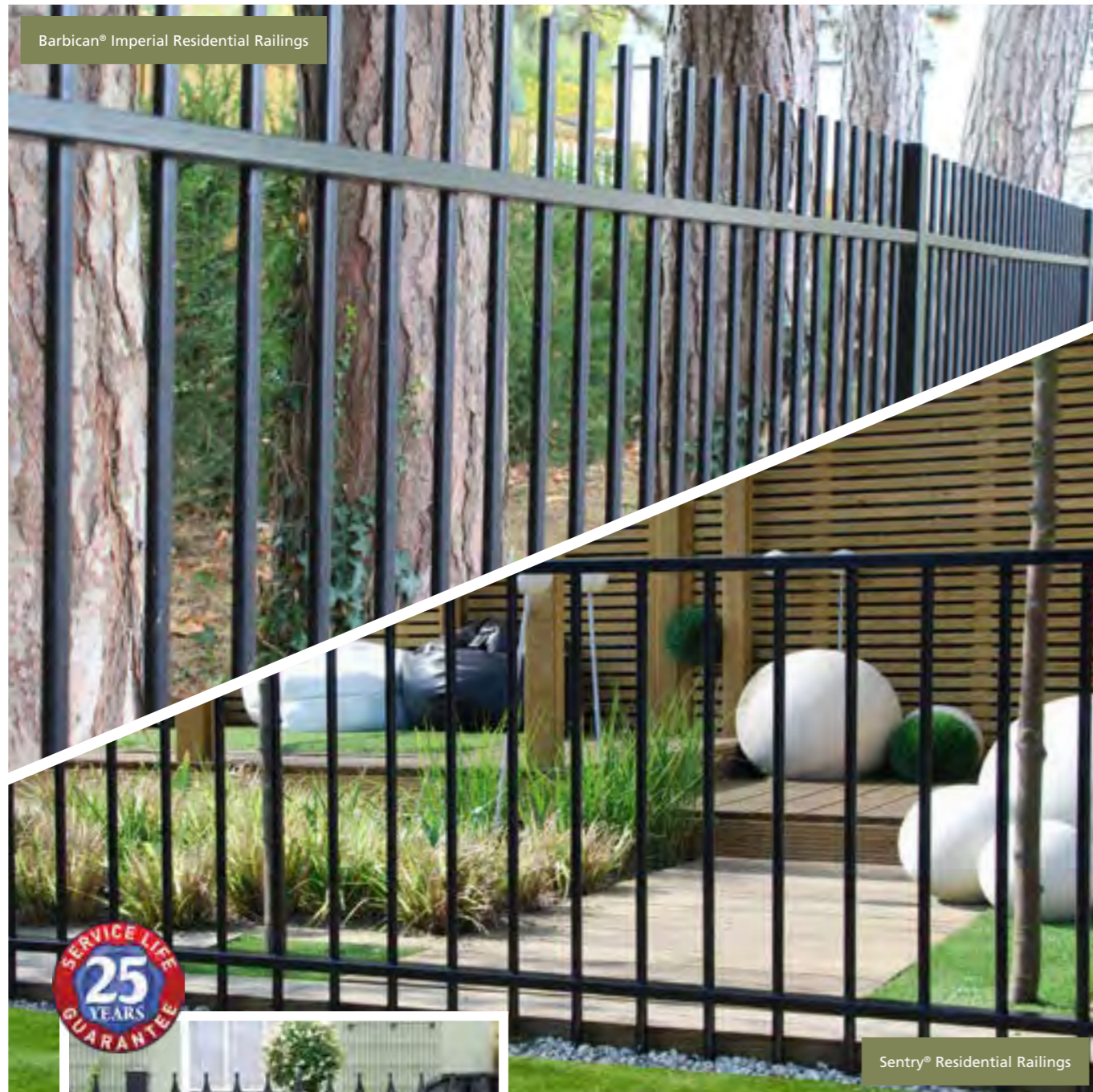
Barbican® Imperial Residential Railings

Our Barbican Imperial® and Sentry® railings are perfect for both residential and larger housing projects. Both have 19mm pales with the Barbican Imperial® Residential railings offering an aesthetically pleasing slender round metal railing design with a range of finials to choose from, whilst our Sentry® Residential Railings offer rounded pales with a flat top rail giving them contemporary style.