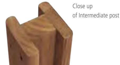
Close up of Intermediate post

Jakposts are 95mm x 98mm, planed finish with two 54mm x 25mm slots for panels. All panels slot easily into position as shown here.