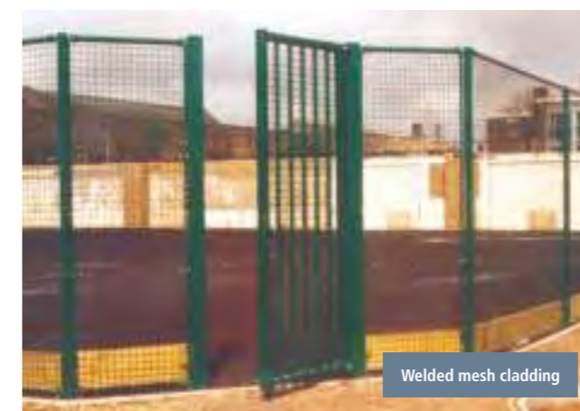
Welded mesh cladding