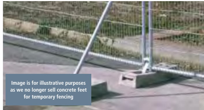
Image is for illustrative purposes as we no longer sell concrete feet for temporary fencing