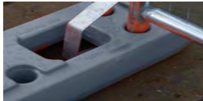
*Thermoplastic foot replaces previous plastic foot filled with concrete.