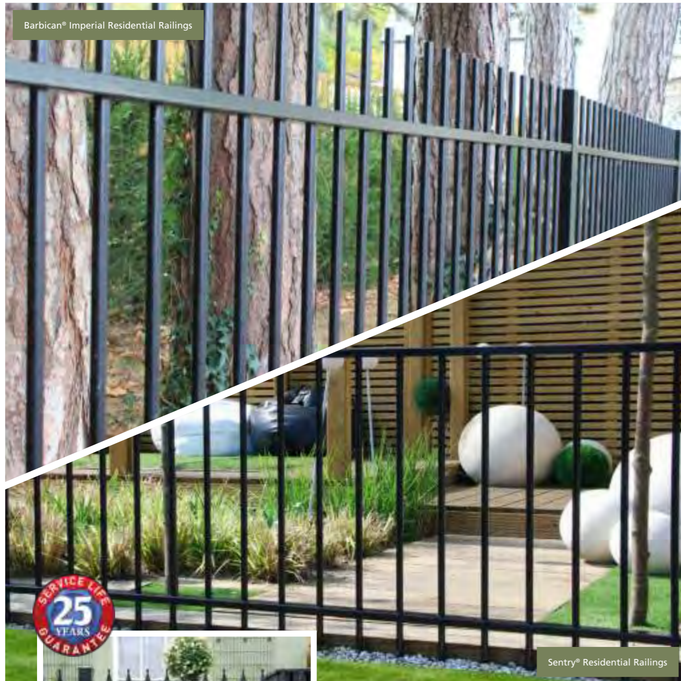
Barbican® Imperial Residential Railings

Our Barbican Imperial® and Sentry® railings are perfect for both residential and larger housing projects. Both have 19mm pales with the Barbican Imperial® Residential railings offering an aesthetically pleasing slender round metal railing design with a range of finials to choose from, whilst our Sentry® Residential Railings offer rounded pales with a flat top rail giving them contemporary style.