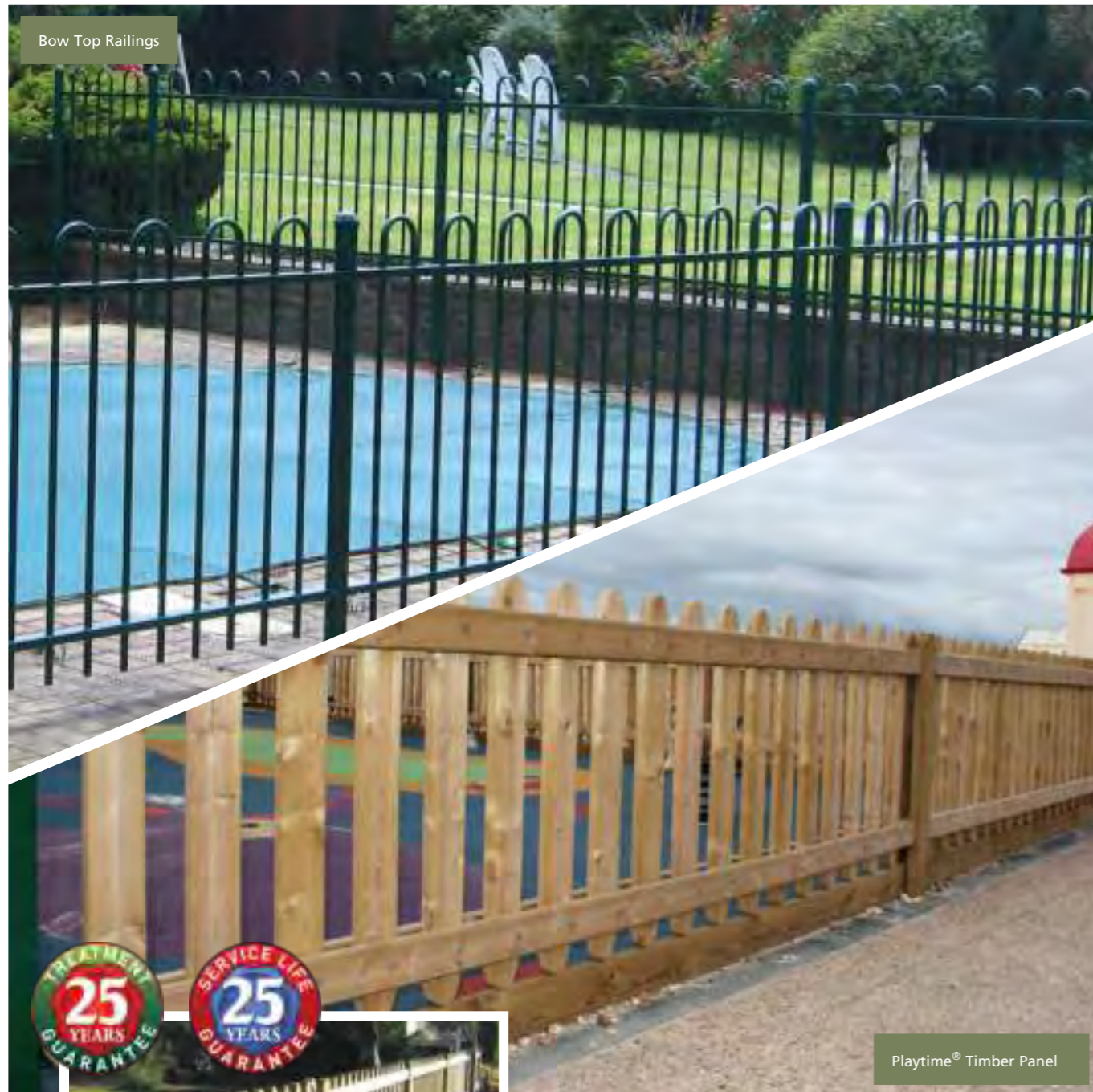
Playtime® Timber Panel

Bow Top has a traditional steel 'hoop' top, pale through rail design and is versatile enough to suit a range of residential or commercial applications.