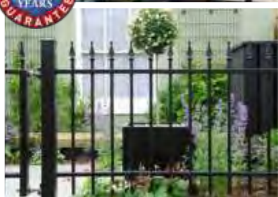
Sentry® Residential Railings