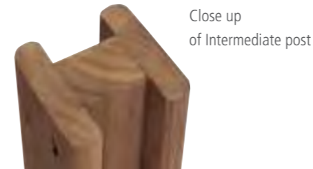
Close up of Intermediate post

Jakposts are 95mm x 98mm, planed finish with two 54mm x 25mm slots for panels. All panels slot easily into position as shown here.