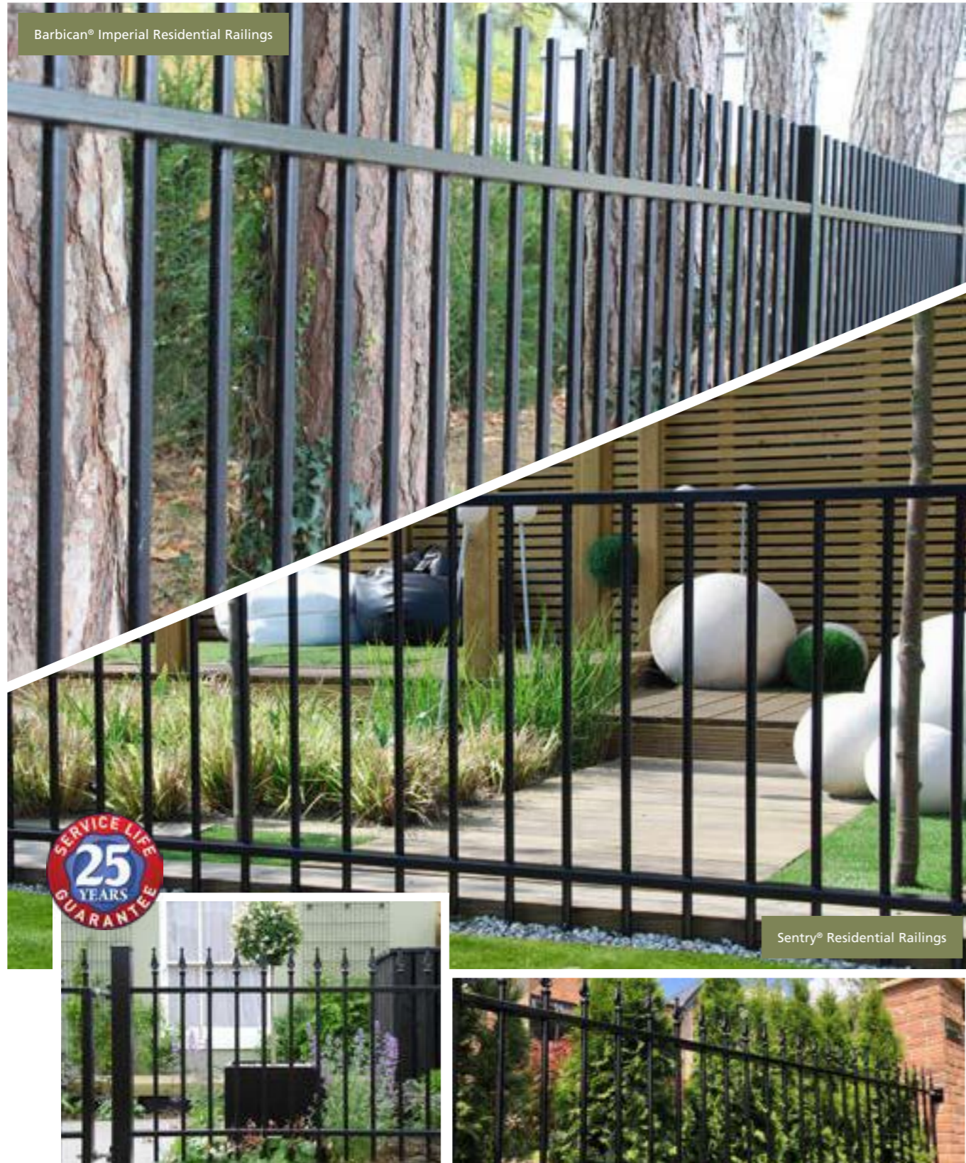
Barbican® Imperial Residential Railings

Our Barbican Imperial® and Sentry® railings are perfect for both residential and larger housing projects. Both have 19mm pales with the Barbican Imperial® Residential railings offering an aesthetically pleasing slender round metal railing design with a range of finials to choose from, whilst our Sentry® Residential Railings offer rounded pales with a flat top rail giving them contemporary style.