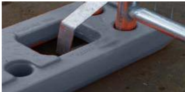
*Thermoplastic foot replaces previous plastic foot filled with concrete.

Express panels are economical as they can be used time after time. Panels stack easily and can be delivered accompanied by fork lift for easy distribution. They are surprisingly light and easy to handle. It is possible to erect four metres a minute.