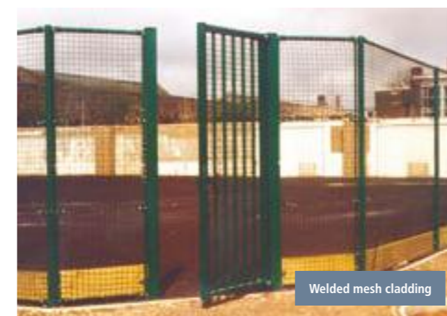
Welded mesh cladding