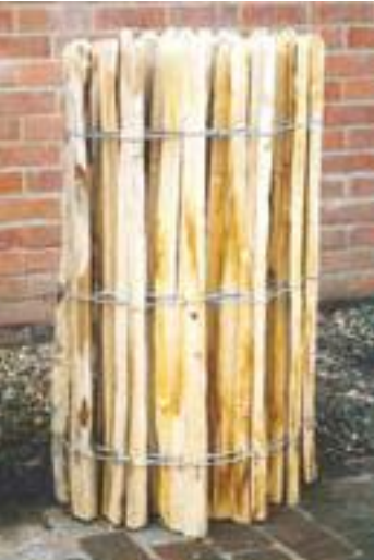
Style B - (3 rows of wire)

Approximate spacing: 81 pales in a 9.10m roll. Pales are 75mm spaced. We recommend installation with our machine round Jakcure® posts for long life.