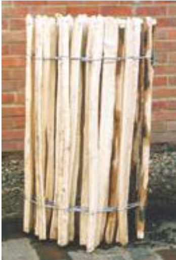
Style A - (2 rows of wire)

Please note: this Chestnut fencing is not Jakcure® treated timber as Chestnut is a hardwood and therefore cannot be guaranteed for 25 years.