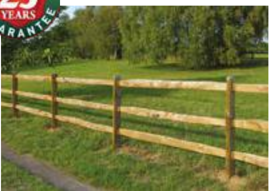
Comprising of half round vertical posts, with either three or four mortices, for the irregular sawn horizontal rails to insert into.