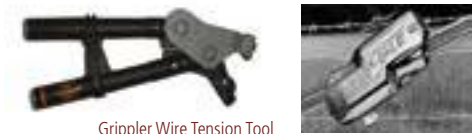
Gripper Wire Tension Tool