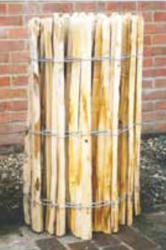
Style B - (3 rows of wire)

Approximate spacing: 81 pales in a 9.10m roll. Pales are 75mm spaced. We recommend installation with our machine round Jakcure® posts for long life.