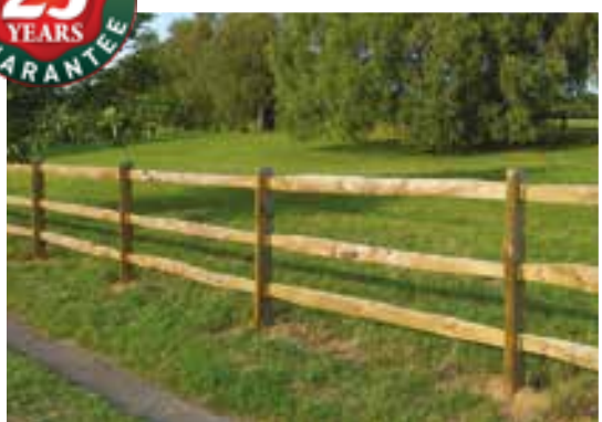
Comprising of half round vertical posts, with either three or four mortices, for the irregular sawn horizontal rails to insert into.