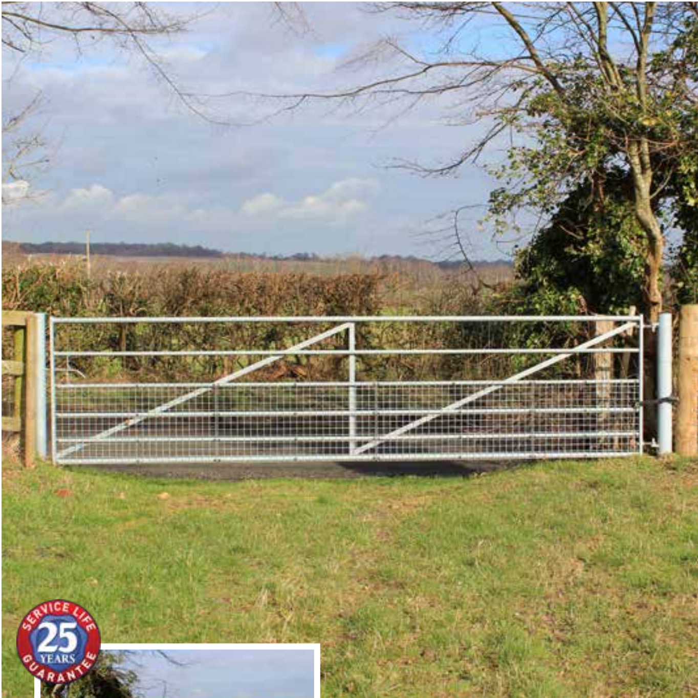
The top and bottom rails are 41.5mm tube, with middle rails which are 32mm tube.

A heavy duty gate is essential for any farm, field or agricultural settings. Our high quality heavy metal field entrance gates are available in a range of designs and sizes. We offer a selection of two styles of metal field gates available singularly or in pairs with a choice of drop bolts. They arrive in a galvanised finish.