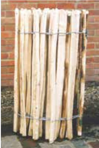
Style A - (2 rows of wire)

Please note: this Chestnut fencing is not Jakcure® treated timber as Chestnut is a hardwood and therefore cannot be guaranteed for 25 years.