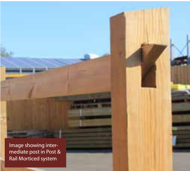
Image showing intermediate post in Post & Rail Morticed system

Allow one post and one prick post for every 2.85m of fence, plus one post for the end of the run. Allow three rails per 2.85m run of 3-rail fence, and four rails per 2.85m of 4-rail fence.