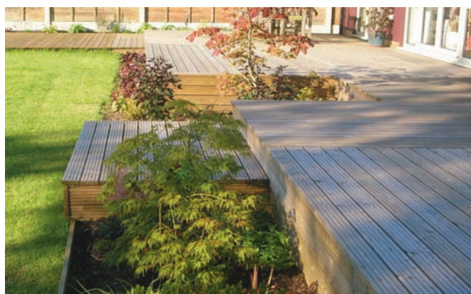
Split level deck dining and relaxing area