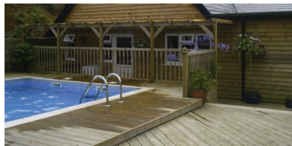
Grooved decking boards as a swimming pool surround

The plain clean boards of a deck can make an ideal setting for showing colourful plants to great effect and an impressive walkway that joins the garden with house is another novel use for deck and balustrade.