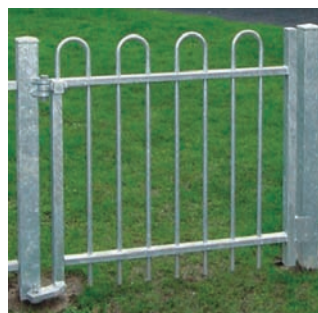
Bow Top single leaf gate