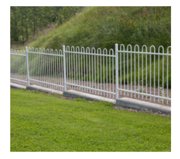
Bow Top Railings

Extra pales set between the standard pales, topped off with a finial within the bow (there is a range of different finials to personalise your fence), please ask us for more details.