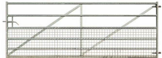
Heavy metal field gate with mesh cladding

Register on the website to gain access to Q40 specification documents and CAD drawings. A fully made to measure service is available. All Jacksons fencing systems and gates maybe designed and manufactured to suit site conditions.